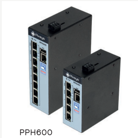
PPH600 with Pixsys Portal integrated